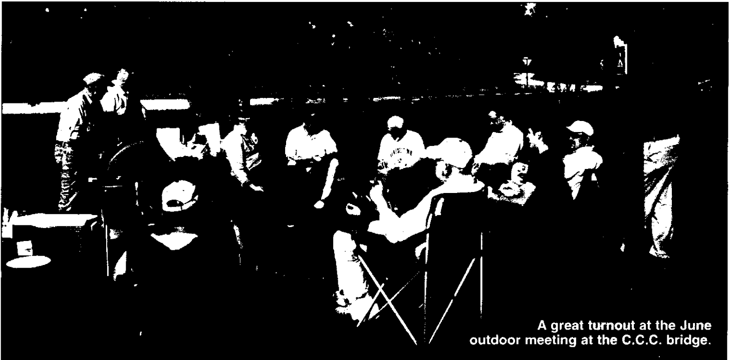
A great turnout at the June outdoor meeting at the C.C.C. bridge.