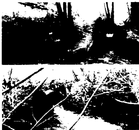
Perched culverts on Kids Creek (above) and Miller (below) are two of seven sites slated for repair where fish passage is blocked by perched culverts.

Besides the on-going Dams project, a busy summer of restoration activities are on tap for the Boardman River. Nine erosion sites are scheduled for repair on Kids Creek and five on the North Branch. In addition, we are working in cooperation with the Grand Traverse Band of Indians, the Natural Resources Conservation Service, Garfield Township, and the Grand Traverse County Road Commission to repair seven road or trail crossings that's impairing fish passage. These are federal Environmental Quality Incentive